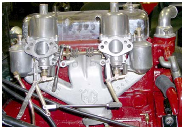
MG SU Carburetors

With a cold engine and the choke on full, why would the fuel mixture be lean? This seemed incongruous. I went back through the basic settings of SU carburetors without positive effect, and then concentrated effort on the operation of the jets. When the choke is pulled, the choke levers lower the jets to enrich the fuel mixture. Were the jets not fully opening when the choke was pulled, were the levers and jets operating consistently, or were the jets sticking or closing at varying levels? Operating the choke levers by hand revealed the jets appeared to be fully lowering, so why would fuel be lacking?