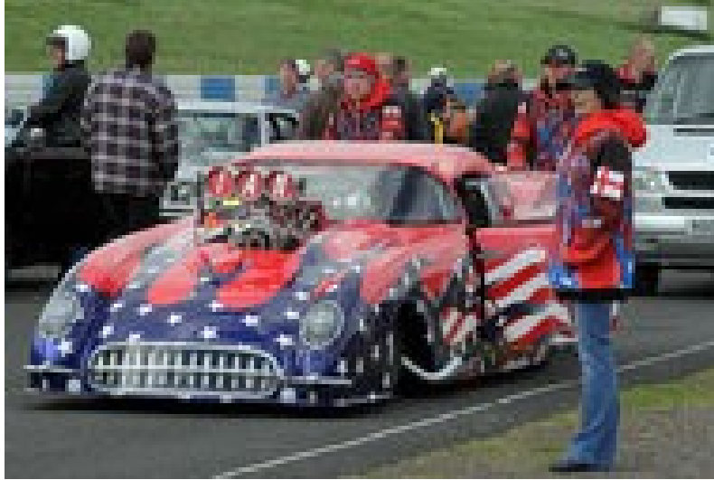
US Race Car in the UK ☺

Mr. Dawood's Club Coupe, also known as a Sedanette, lacks power steering but has several options, including a Hydra-Matic transmission — which added $174 to the 1949 sticker price of $2,966 — as well as power windows and seats. Befitting a Cadillac, it is fitted with the modern conveniences of its day, including a cigar lighter, multiple ashtrays and enough headroom for a driver to wear his fedora.