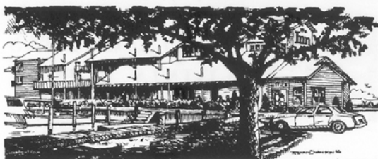
Tilghman/Knapps Narrow Inn

MARK YOUR CALENDARS MAKE YOUR RESERVATIONS MINI ~GOF ~ MAY 4-6, 2007 TILGHMAN ISLAND, MARYLAND