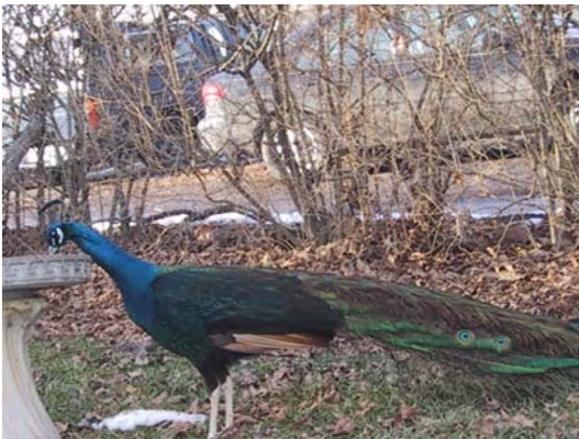
Even the peacock came