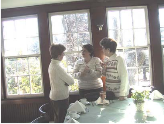
Aaah – ladies talk!