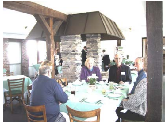
Where's the food?