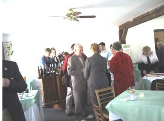
Lots of chit-chat

Our Annual Winter Eat Out was held on Sunday, February 6 at lovely Gabriel's Inn, Ijamsville, Maryland. As always, a good time was had by all, and the food, as usual was excellent. Here are some shots of our club members having fun.