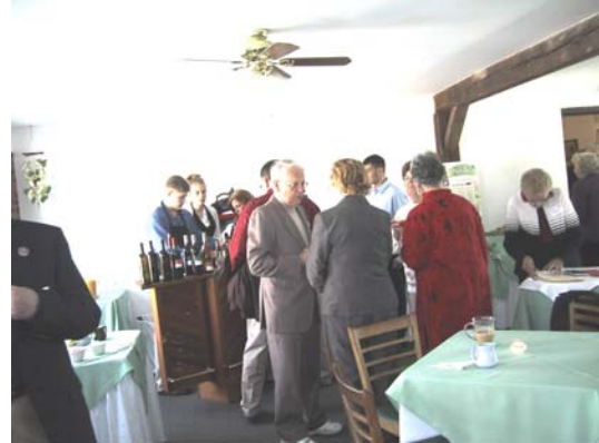
Lots of chit-chat

Our Annual Winter Eat Out was held on Sunday, February 6 at lovely Gabriel's Inn, Ijamsville, Maryland. As always, a good time was had by all, and the food, as usual was excellent. Here are some shots of our club members having fun.